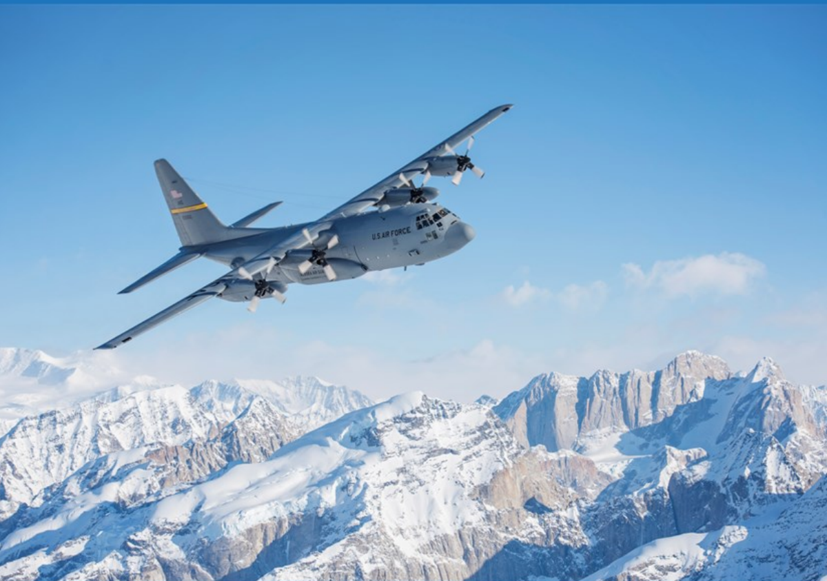
C-130 Hercules over Denali National Park and Preserve, AK